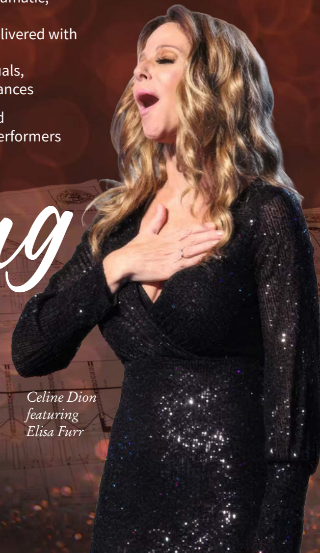
Celine Dion featuring Elisa Furr