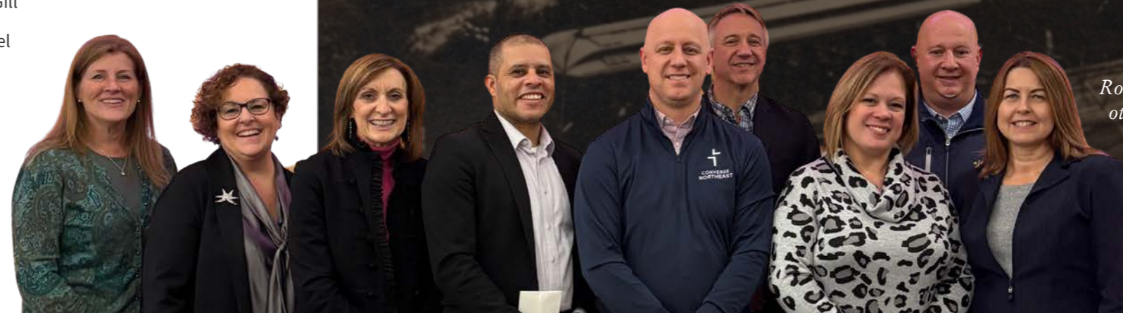
Rooted in our mission to be a blessing to others, Elim Park supports organizations that serve our surrounding community. Pictured here are representatives from Converge Northeast, Hope Pregnancy Center, Charlotte's Web of Prayer, Urban Alliance, and the Cheshire Senior Center.